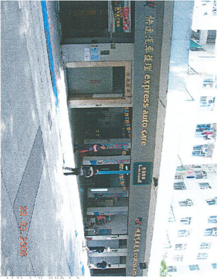
② EXPRESS AUTO CARE & ③ UNITED MOTOR SERVICE LTD.