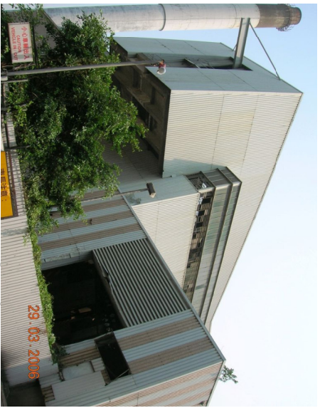
④ KENNEDY TOWN ABATTOIR SITE