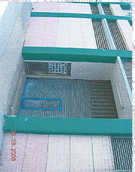
① KENNEDY TOWN SWIMMING POOL