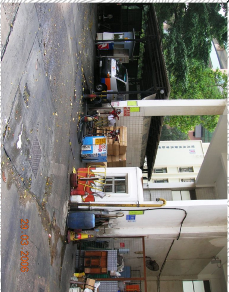
⑤ NEW WORLD FIRST BUS DEPOT